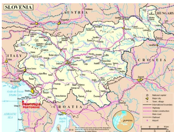
Map of Slovenia